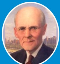
Rtn. Paul Harris Founder